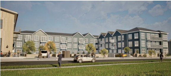
STREET VIEW - FROM RED BARN BLVD.