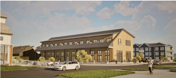
STREET VIEW - CORNER RED BARN BLVD. X MARKET AVE.

© COPYRIGHT RESERVED. THESE DRAWINGS AND THE DESIGN CONTAINED THEREIN AT ALL TIMES REMAIN THE EXCLUSIVE PROPERTY OF THE DESIGN ARCHITECTURE EVERYDAY INC. NO REPRODUCTION OR FURTHER USE OF ANY PART OF THIS DRAWING IS ALLOWED WITHOUT THE WRITTEN CONSENT OF THE DESIGN ARCHITECTURE EVERYDAY INC.