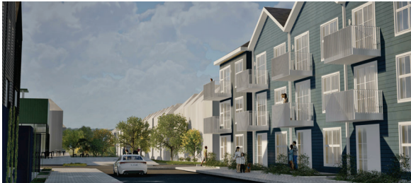
STREET VIEW - WOONERF TOWARD HAMMERMILL AVE. CORNER