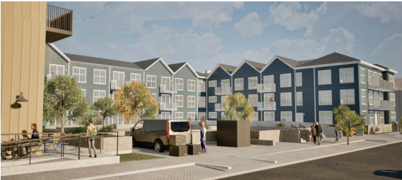
STREET VIEW - INNER COURTYARD (OFF RED BARN BLVD.)