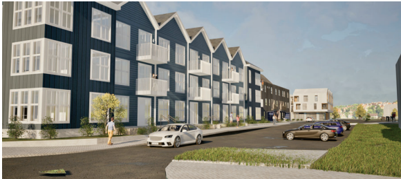
STREET VIEW - HAMMERMILL AVE. LOOKING EAST