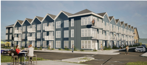
STREET VIEW - CORNER OF HAMMERMILL AVE. X WOONERF