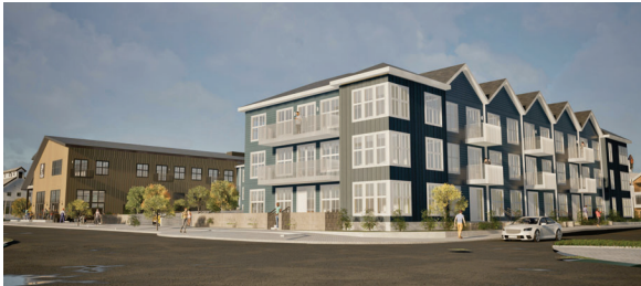
STREET VIEW - CORNER HAMMERMILL AVE. X RED BARN BLVD.