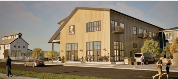
STREET VIEW - WEST CRU ENTRANCE