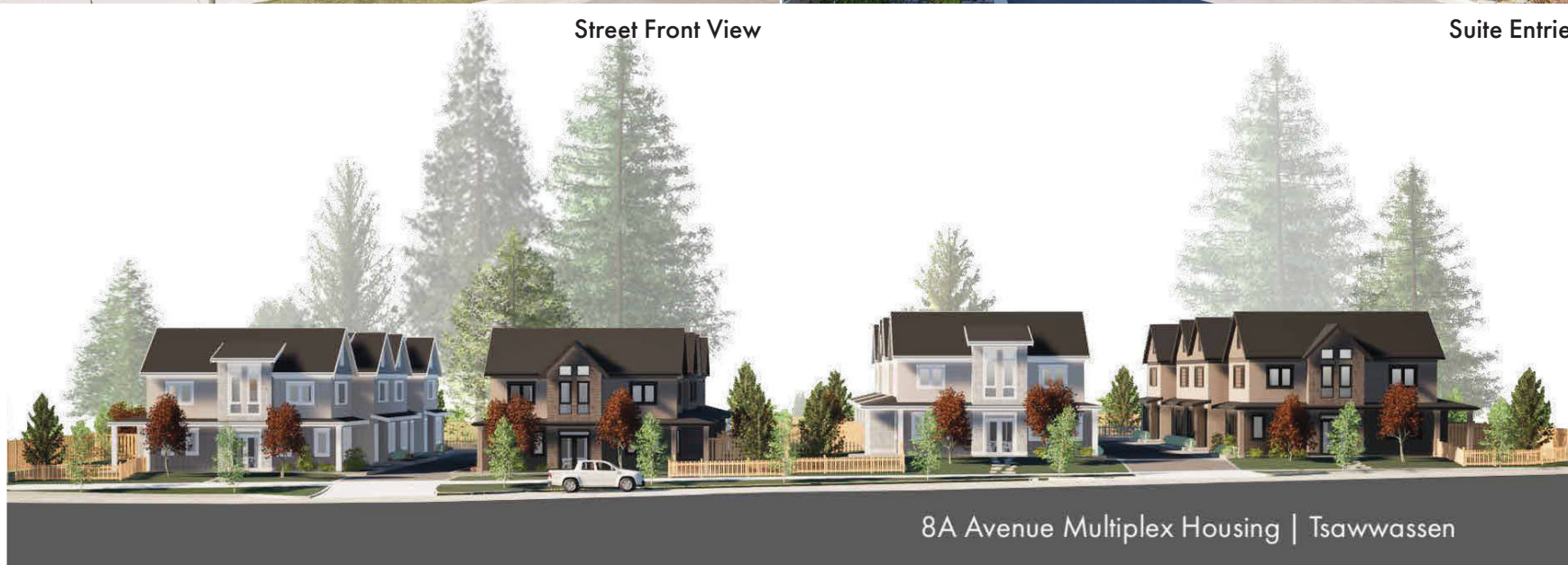
8A Avenue Multiplex Housing | Tsawwassen

NOTE: The above image is an Artist's impression of the project concept. It is not intended to be referenced for construction purposes. Nothing depicted here shall be construed to represent instructions for materials, methods, or configuration of the Work. Refer to drawings and specifications.