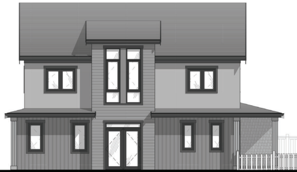
NORTH (FRONT) ELEVATION (ALTERNATIVE) Scale: 1 : 60