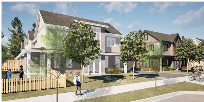
Street Front View