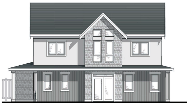
NORTH (FRONT) ELEVATION Scale: 1 : 60