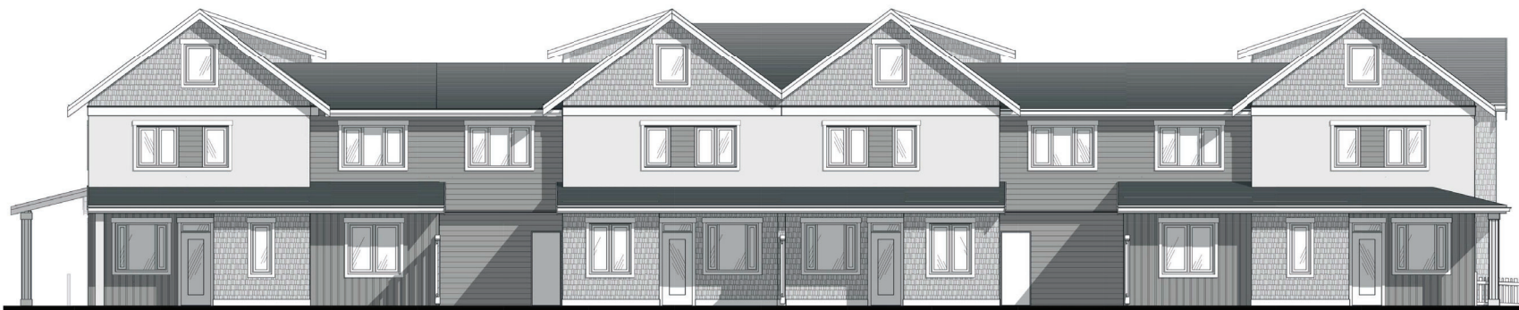
EAST (YARD) ELEVATION Scale: 1 : 60