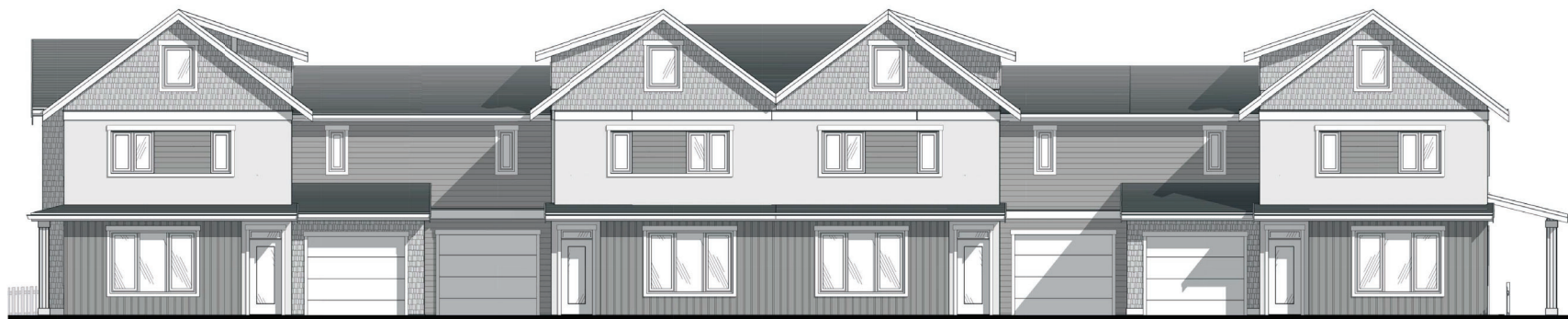
WEST (LANE) ELEVATION Scale: 1 : 60