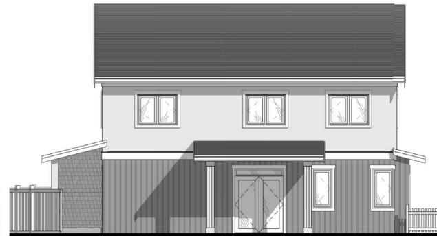
SOUTH ELEVATION Scale: 1 : 60