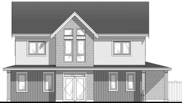
NORTH (FRONT) ELEVATION (LOT 4 ONLY) Scale: 1 : 60