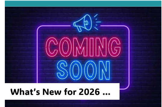
What's New for 2026 ...