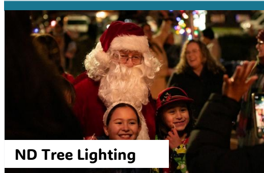
ND Tree Lighting