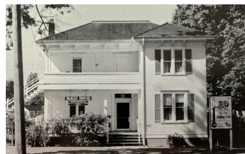
(Feature image for promotional materials)