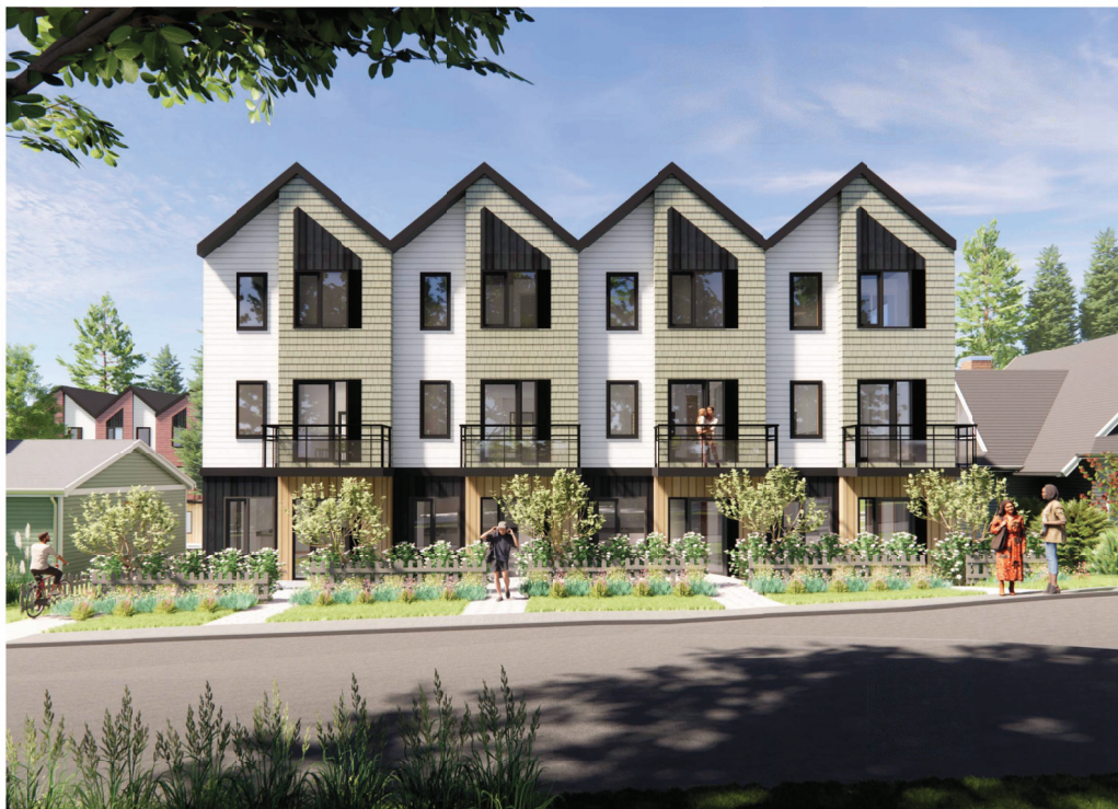
NOTE: The above image is an Artist's impression of the project concept. It is not intended to be referenced for construction purposes. Nothing depicted here shall be construed to represent instructions for materials, methods, or configuration of the Work. Refer to drawings and specifications.