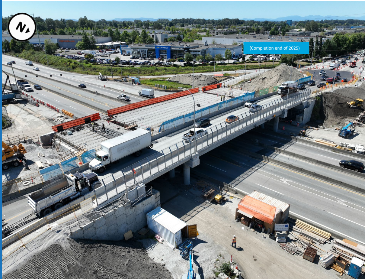
Girder installation on the south portion of the Steveston Interchange Project, August 2025.