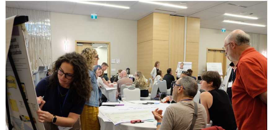
Active Transportation Workshop at Cascades Casino September 17, 2025