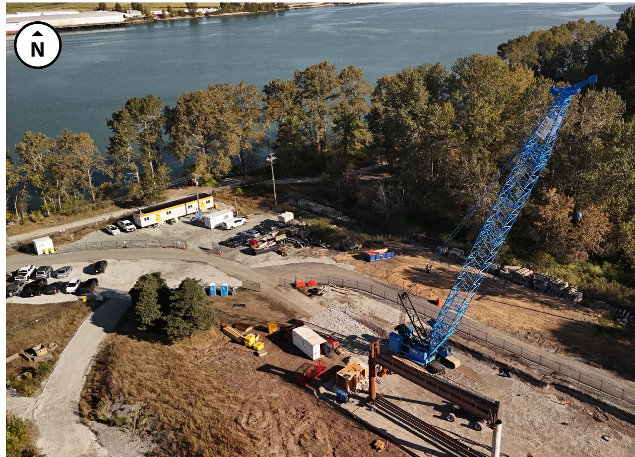
Geotechnical investigations at Deas Island setting up a frame to install sheet piles, September 2025