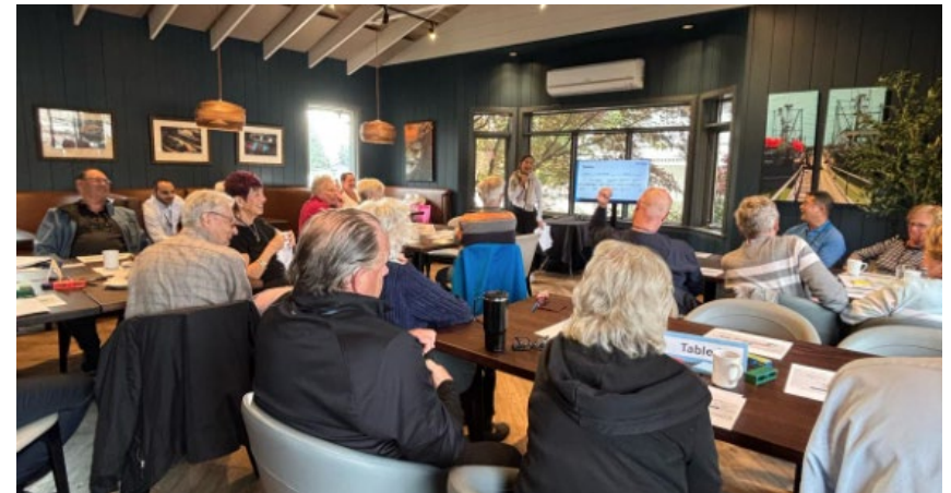
Discussions on Preparatory Construction Works with RiverWoods residents October 7, 2025