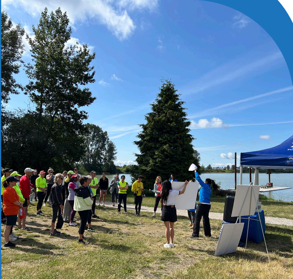
Special Pop-up event for the Delta Deas Rowing Club, June 28, 2025