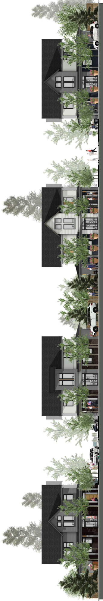
8A Lot Frontage Elevation