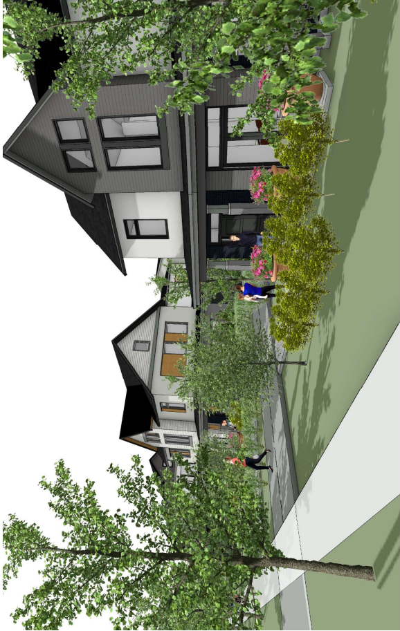
Streetfront Unit Elevation