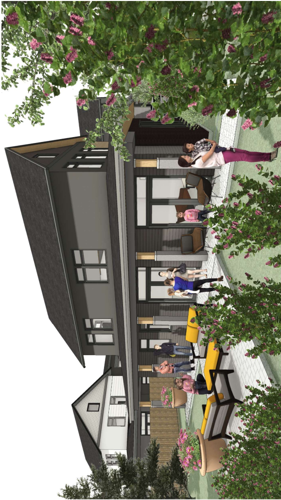
Interior Unit Elevation