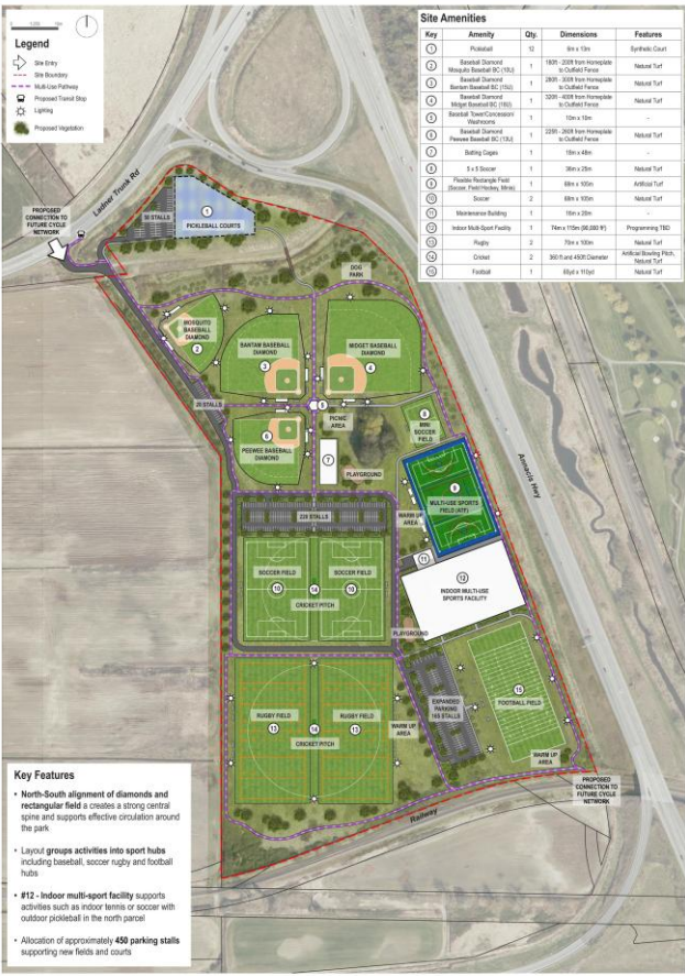
John Oliver Park Master Plan Concept 2