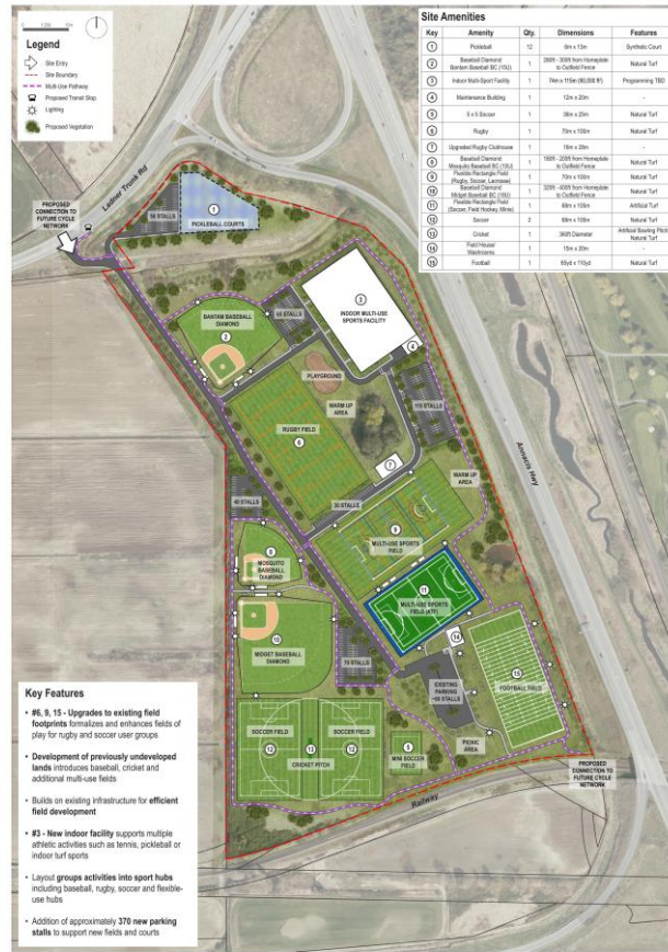
John Oliver Park Master Plan Concept 1